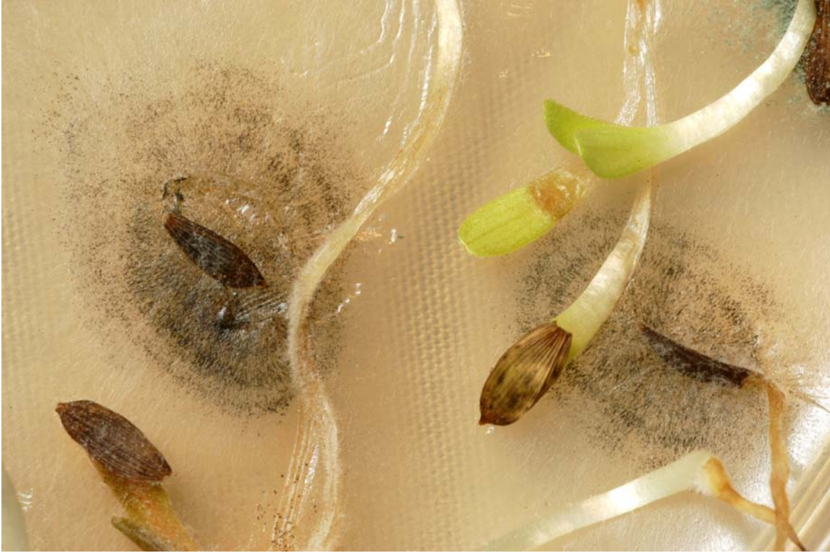
Fig. 3. Verticillium dahliae colonies from infested seed from a commercial seed lot 10 days after plating seed on the NP-10 medium.